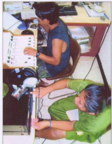
Radio Team Students in the broadcasting booth "On-Air"

workshops. Our initial visits to the centre resulted in the first Ak Kutan FM radio play The Story of the Corn .