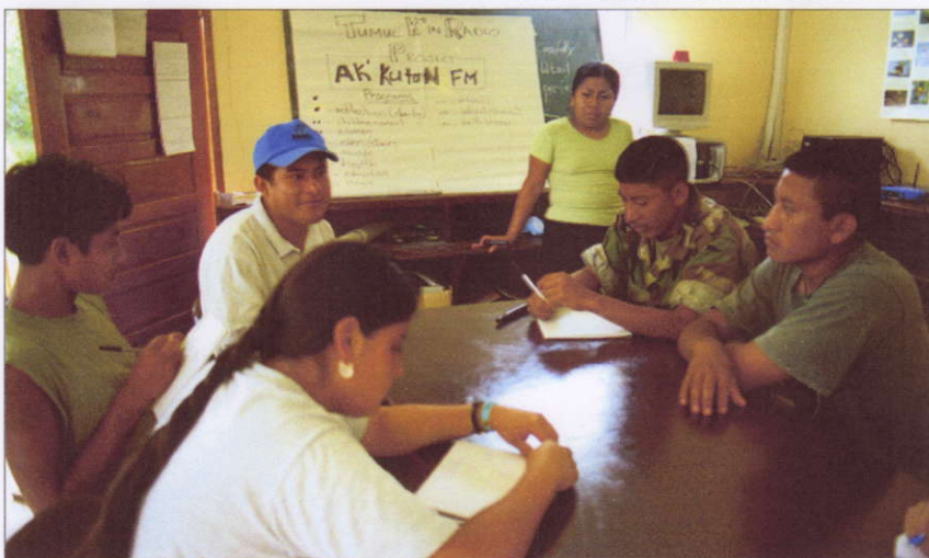
Ak' Kutan FM Radio Team in a Planning Session with Caracol Getting the equipment in July 2005 was a big step and led to the communities coming together to find a

The station is in the process of raising the final US$4000 to complete the antenna. If any Caracol friends have knowledge of community radio, training, funding or networks we would love to hear from you.