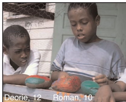
Deorie, 12 Roman, 10